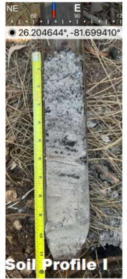
Soil Profile I